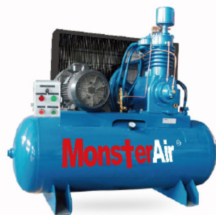
▲ K15U-450H-12BAR K15U-450H-14BAR