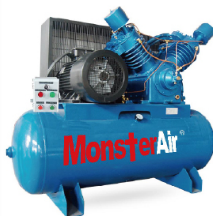
▲ K25U-450H-12BAR K25U-450H-14BAR